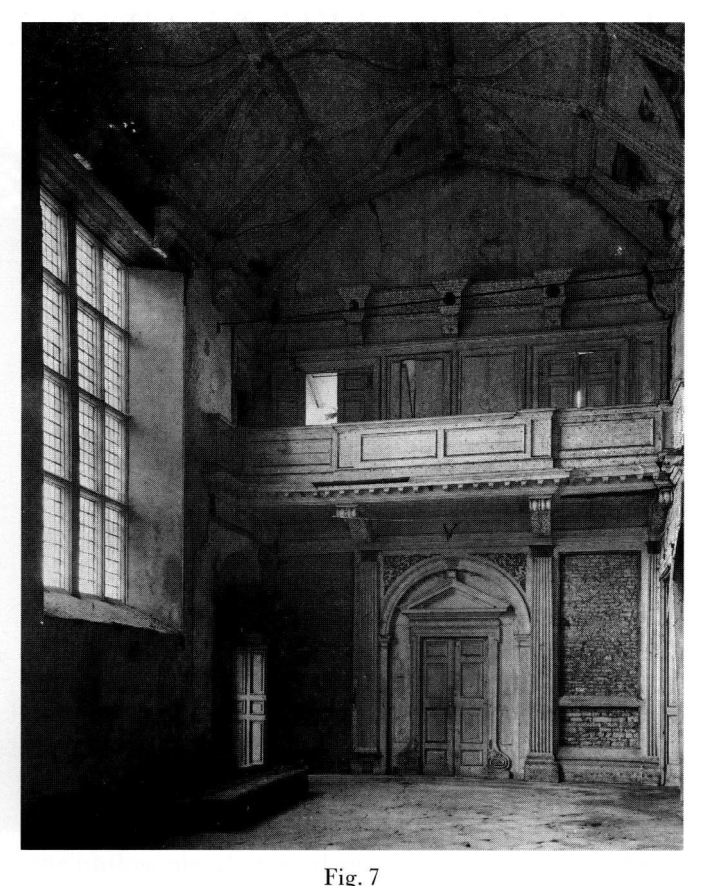
The east end of the great hall at Kirby Hall, Northamptonshire, in 1906, before the house was taken into state guardianship

The Ministry had long been responsible for a clutch of important historic houses (the royal palaces and villas, and houses such as Chiswick House and Audley End which had been given to or acquired for the nation), which had always been somewhat treated differently from the rest of the sites. However, with the Ministry's gradual shedding of its earlier lack of interest in postmedieval buildings came its acquisition of a series of ruined historic houses (e.g. Sutton Scarsdale (1971), Witley Court (1972),Northington Grange (1975)). Those houses were taken on explicitly as exemplars, in order 'to preserve those ruined and neglected examples polite of