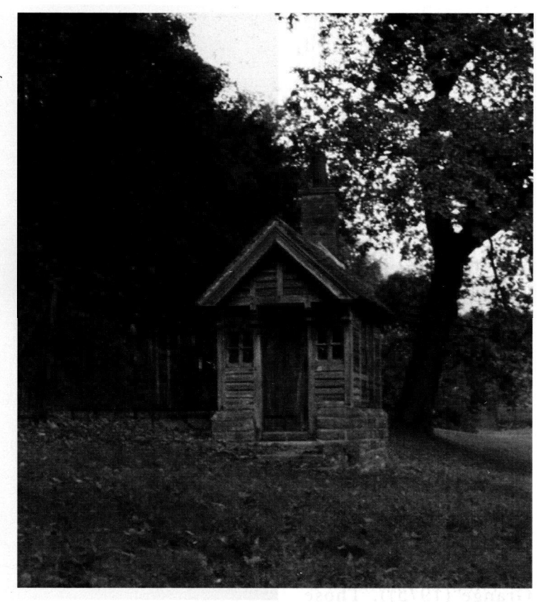
Fig. 5 The custodian's hut at Furness Abbey, Cumbria, built c. 1930. Like many of the structures erected by the Ministry to serve guardianship sites, its solid structure, highquality materials and gentle Arts-and-Crafts design have seen it age well