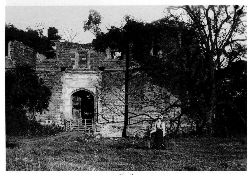
Fig. 3 Kirby Muxloe Castle, Leicestershire, from the west at the turn of the twentieth century. The site came into state guardianship in 1911

The clear separation which the custodians of early nineteenth- and early twentieth-century monuments saw between built structures and the landscape in which they stood was another factor fundamental to the Ministry of Works' approach.